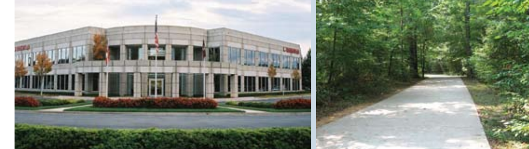
The North Fulton Community Improvement District stretches along the Georgia 400 corridor from Mansell Road north.

$700,000: CID Investment in Mansell Road Streetscape Priceless New Gateway to North Fulton Created